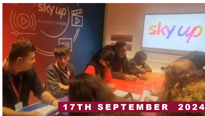
17TH SEPTEMBER 2024