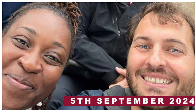
5TH SEPTEMBER 2024