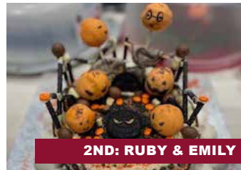
2ND: RUBY & EMILY