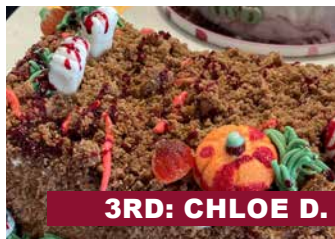
3RD: CHLOE D.