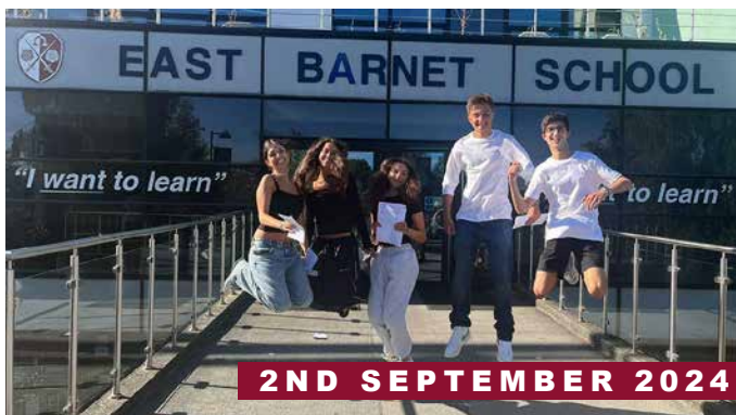
2ND SEPTEMBER 2024