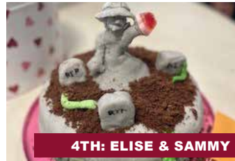
4TH: ELISE & SAMMY