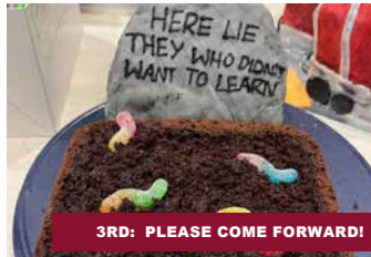
3RD: PLEASE COME FORWARD!